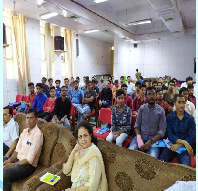
CoP at Malout, Muktsar Sahib (Punjab) held on 04.09.2019