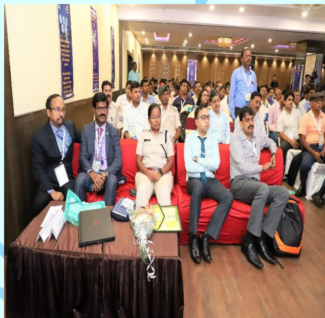
Seminar on “Cyber Frauds, General Awareness and Cyber Security Measures” at Jamshedpur (Jharkhand) held on 26.09.2019