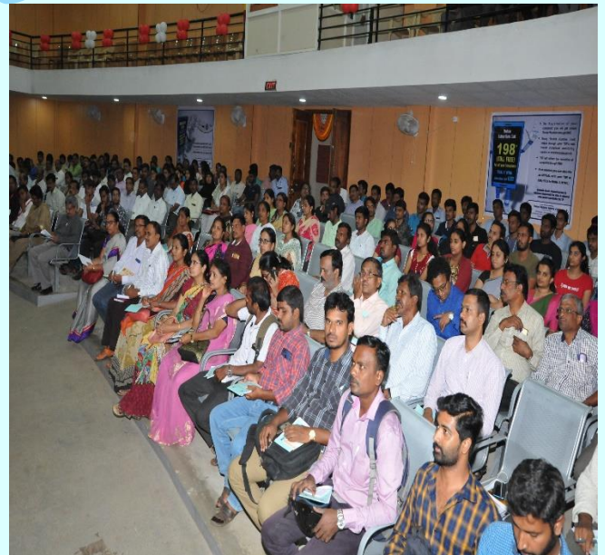
CoP at Tumkur (Karnataka) held on 13.09.2019