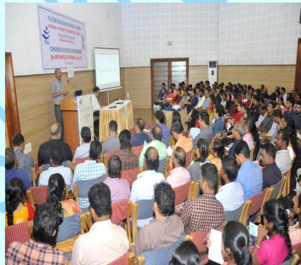
CoP at Kozhikode (Kerala) held on 26.09.2019

Full details of the Directions/Orders/Consultation Paper/Report, Subscription Data, etc mentioned in this newsletter are available on TRAI website www.trai.gov.in