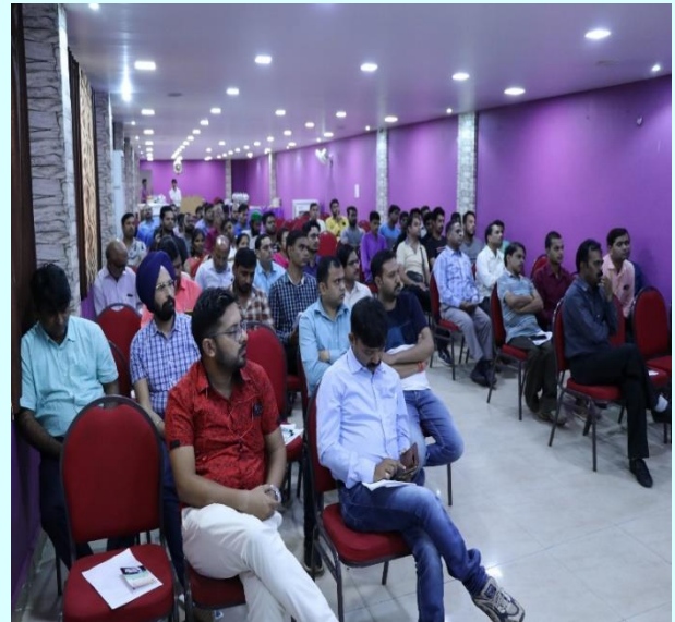
CoP at Katni (Madhya Pradesh) held on 26.09.2019