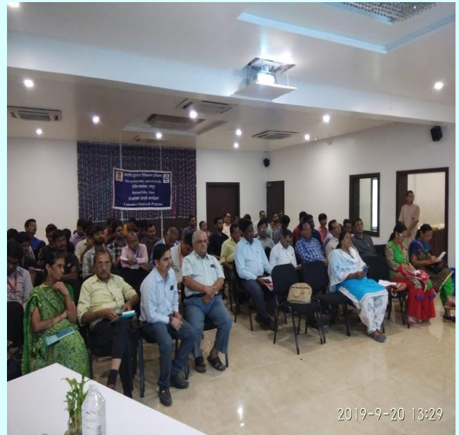
CoP at Junagarh (Gujarat) held on 20.09.2019