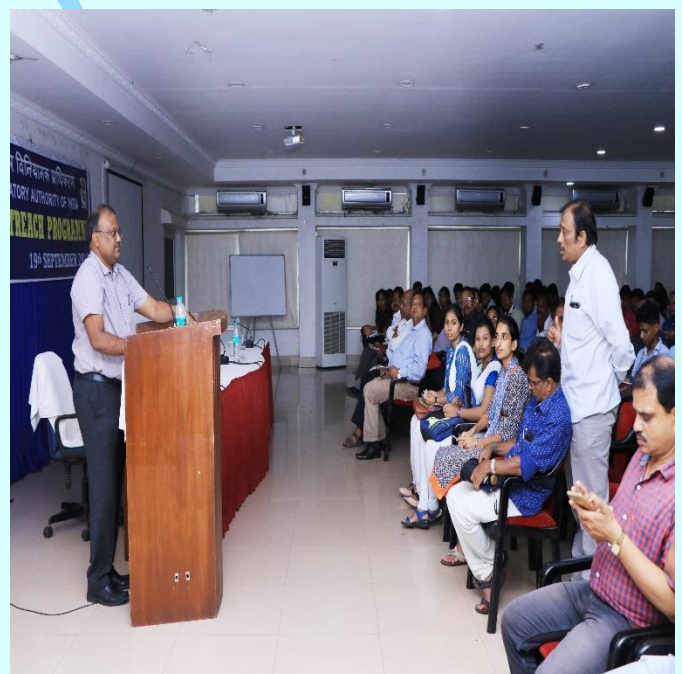
CoP at Bhubaneswar (Odisha) held on 19.09.2019