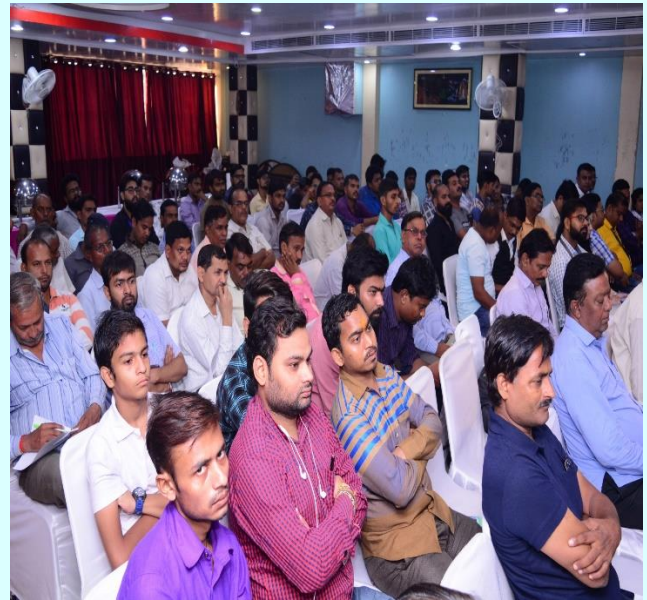
CoP at Fatehpur (Uttar Pradesh) held on 05.09.2019