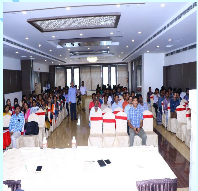
CoP at SangaReddy (Telangana State) held on 26.09.2019