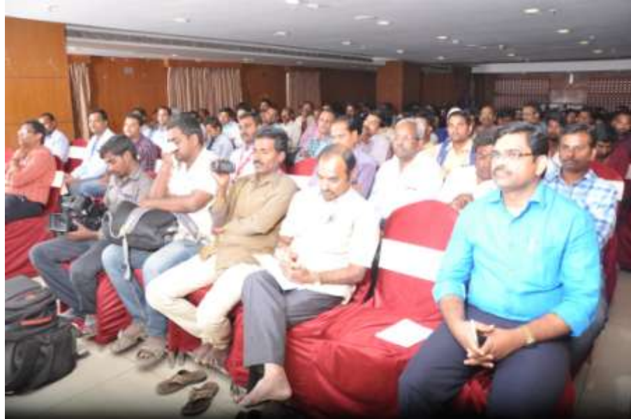
CoP at Nizamabad (Telangana) held on 29.11.2018