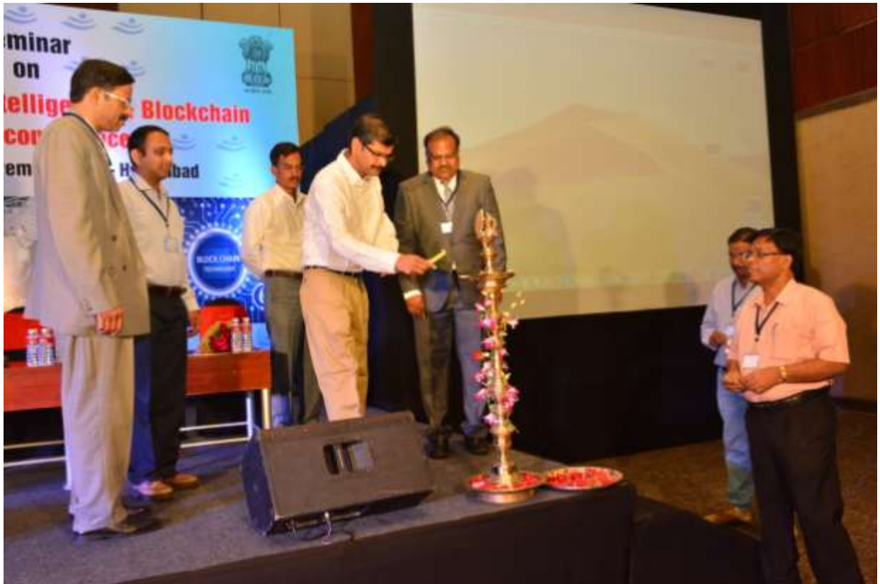
Seminar on “Use of Artificial Intelligence and Blockchain in Telecom Sector” at Hyderabad on 15.11.2018