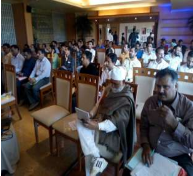
CoP at Katra (J&K) held on 01.11.2018