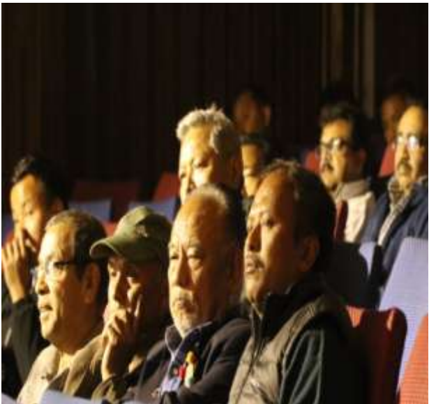
CoP at Kalimpong (West Bengal) held on 15.11.2018