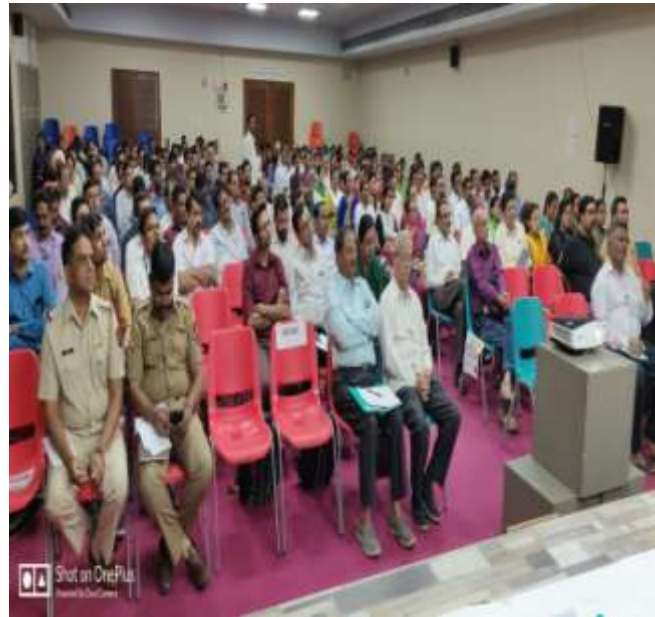
CoP at Nasik (Maharashtra) held on 16.11.2018