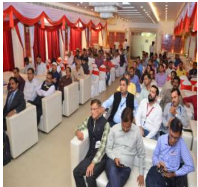
CoP at Hardoi (Uttar Pradesh) held on 15.11.2018