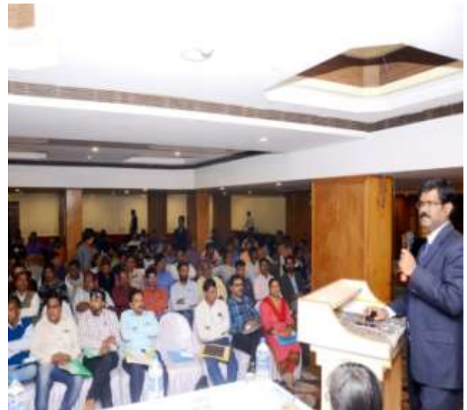
CoP at Bokaro (Jharkhand) held on 20.11.2018