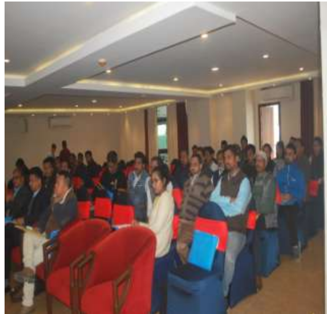
CoP at Namchi (Sikkim) held on 15.11.2018