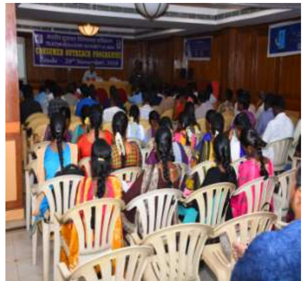
CoP at Erode (Tamilnadu) held on 29.11.2018

Full details of the Directions/Orders, Consultation Paper/Report, Subscription Data, etc mentioned in this newsletter are available on TRAI website www.trai.gov.in