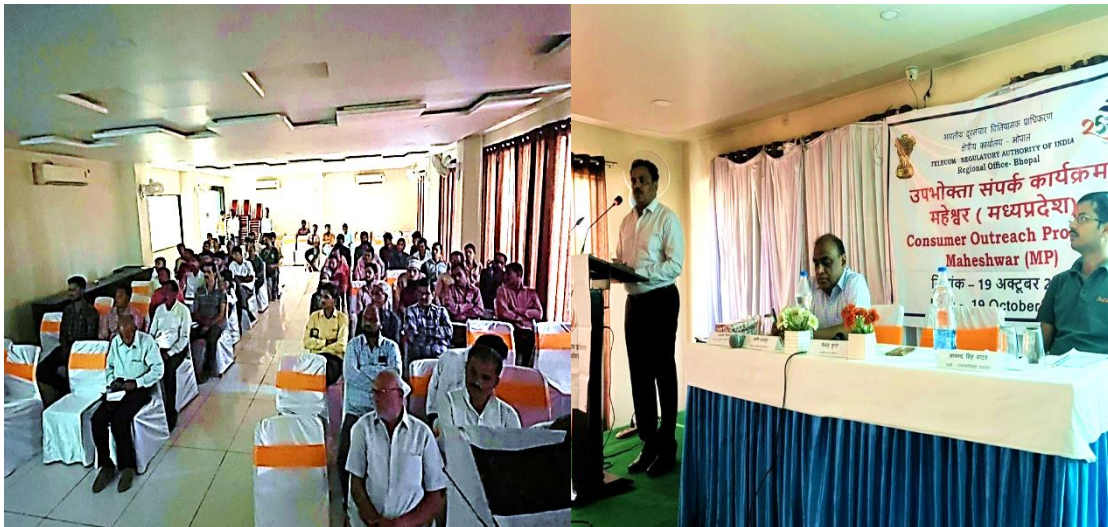
Special Consumer Outreach Program for skill development for weavers at Maheshwar (Madhya Pradesh) held on 19 th October 2022, conducted by Regional Office, Bhopal