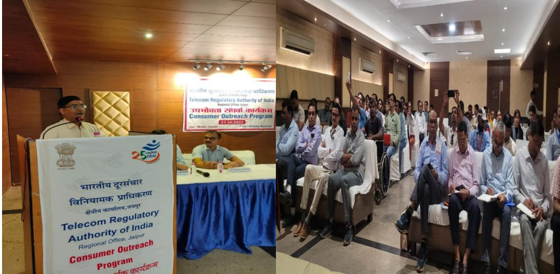
Special Consumer Outreach Program for divyangjan at Bhilwara, Rajasthan held on 11 th October 2022, conducted by Regional Office, Jaipur